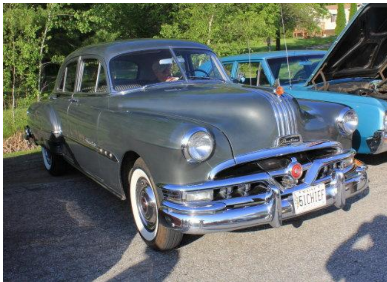
Gardiner Cruise in 2013

I continued to run into the car from time to time at the Gardiner cruise in.