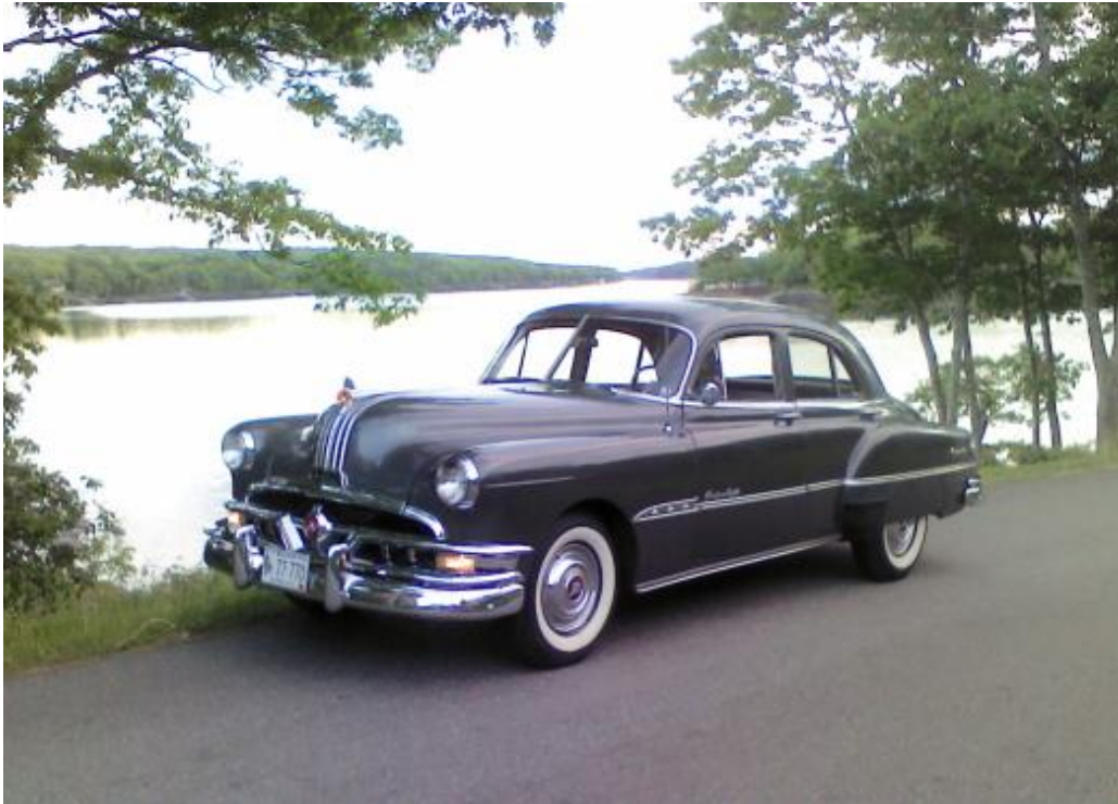
Glamour Shot 6/7/2020

I purchased the car on 8/31/2018 – A couple of week later I took to the Gardiner Cruise In but found it to be starving for fuel at speed or on hills. That turned out to be a plugged fuel line from the tank. As a last resort I blew out the line with an air hose and the car has run fine since. In 2019 I took it out of storage for the first ride and the brake pedal went to the floor. In June 2020 I rebuilt the master cylinder and the car is back in action one again. On 6/7/2020 we took it for a ride and it turned 45,000 miles which I believe to be original.