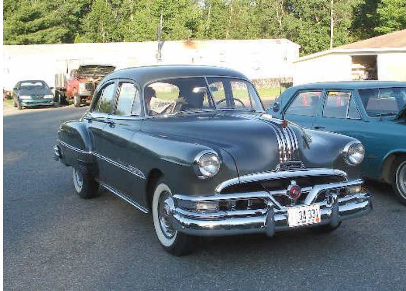
1951 Chieftain at Meetinghouse Market in 2009