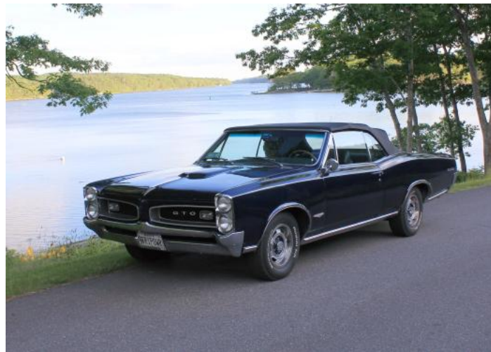
1966 GTO – 6/13/2020