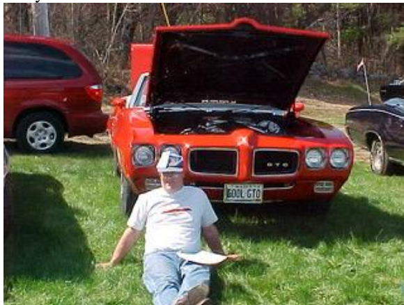
GTO's at Fast Eddie's