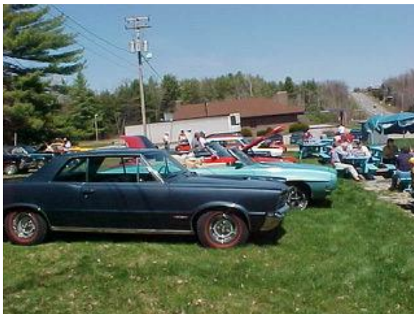
A previous year at Fast Eddie's