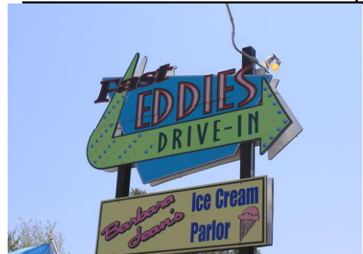
Fast Eddies Drive In, Route 202 Winthrop