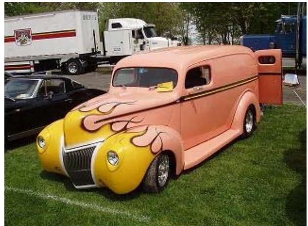
A very nice panel truck rod!