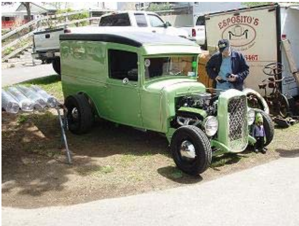
Nice little sedan delivery!

If you get a chance next spring, this trip would be well worth your while. The Hudson River Valley Antique Auto Association do an incredible job putting on this event each year. When you think of the amount of effort involved in staging this (over 2000 vehicles versus our 150 at the Anheuser-Busch Show) it is staggering! Very rarely do you hear a complaint. For more information go to http://www.rhinebeckcarshow.com .