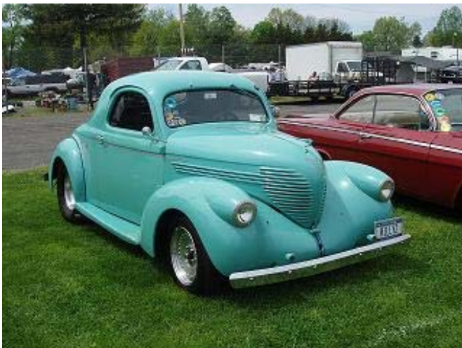
Clean Willys Rod