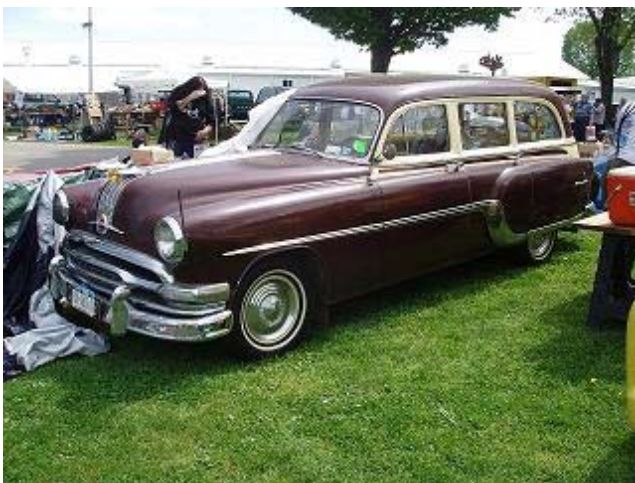
A Safari wagon being used by a vendor