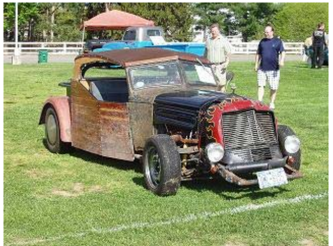
From the "What the Heck Is It ?" Department