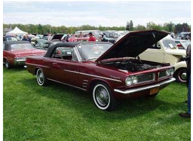
1963 Four Cylinder Tempest